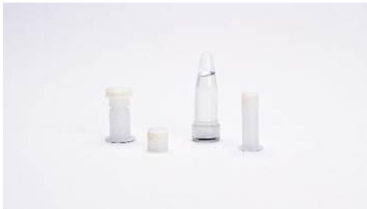
Figure 2: Unyvero sample tube, sample tube cap, sample pre-treatment tool and Master Mix tube

The Unyvero A50 Analyzer instrument consists of mechanical, electronic, pneumatic and optical elements and enables a fully-automatic random-access processing of the Application Cartridges. Once a run is started, the Unyvero A50 Analyzer automatically executes and controls all sample processing and analysis steps (including DNA extraction, DNA purification, PCR set-up, highly multiplexed end-point PCR amplification and a hybridization array-based fluorescence detection) inside the Application Cartridge. For safety and equipment longevity, and to avoid issues of calibration or waste-removal, the Unyvero A50 Analyzer contains neither reagents nor waste. All fluids are handled within the sealed Application Cartridge. Up to four Unyvero A50 Analyzers can be attached to a single Unyvero C8 Cockpit and each Unyvero A50 Analyzer includes the two available slots that provide full random access per Unyvero A50 Analyzer, allowing the processing of up to eight patient samples simultaneously within four to five hours. In the future, OpGen believes a further expansion to up to eight Unyvero A50 Analyzers will also be possible.