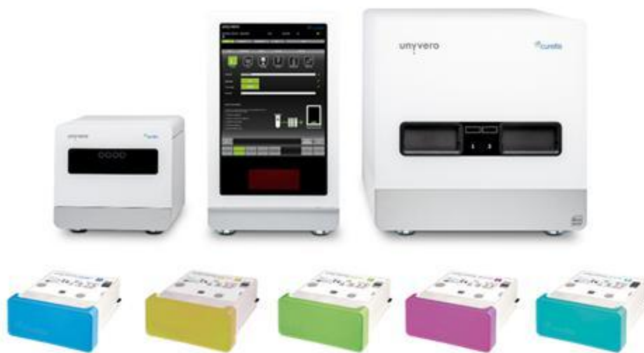
Figure 1: Unyvero A50 Platform

The Unyvero A50 System consists of three devices, the Unyvero L4 Lysator, the Unyvero C8 Cockpit and the Unyvero A50 Analyzer. The Unyvero L4 Lysator is used for sample pre-processing and pathogen lysis. The Unyvero C8 Cockpit is the control panel for the Unyvero L4 Lysator and Unyvero A50 Analyzer and displays the results of patient sample analysis. The Unyvero A50 Analyzer integrates mechanical, electronic, pneumatic and optical elements and enables a fully automatic random-access processing of the Application Cartridges. The Application Cartridges are single-use, disposable and disease specific. The Unyvero System, together with proprietary software and the Application Cartridges, comprise the Unyvero A50 Platform.